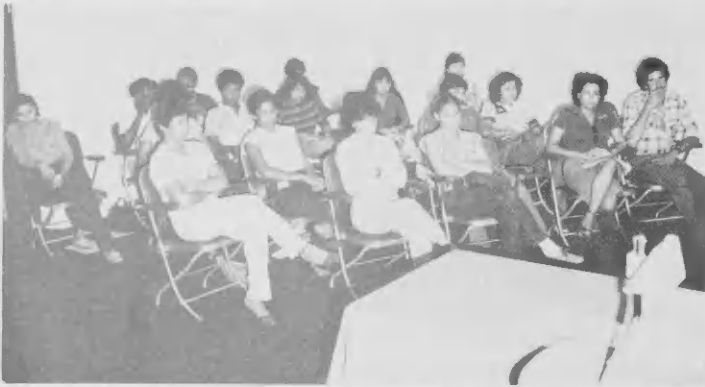
The summer training students attended an orientation program to become more familiar with their surroundings at Lago. A total of over 70 college students, (summer training